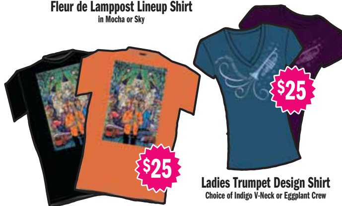
Official Poster Shirt Choice of Pumpkin or Black