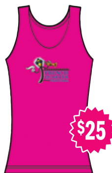
Festival Tank Top Available in Berry