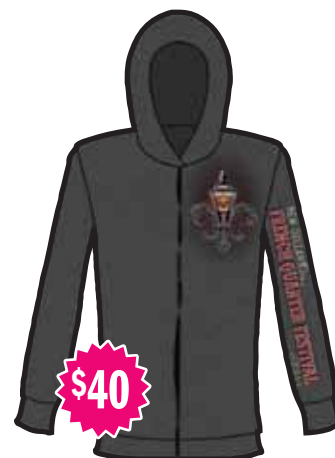
Dark Grey Hoodie

All French Quarter Festival wear is 100% cotton. Additional $3 for 2XL and 3XL sizes.