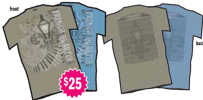
Fleur de Lamppost Lineup Shirt in Mocha or Sky

Image Size 19" x 28½" – Poster Size 22" x 34"