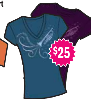
Ladies Trumpet Design Shirt Choice of Indigo V-Neck or Eggplant Crew