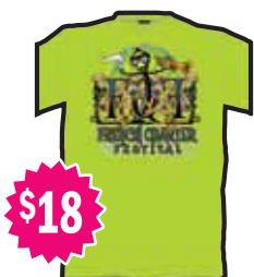
Kid's Design Shirt